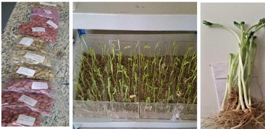
Figure 2. Some photos during the work.